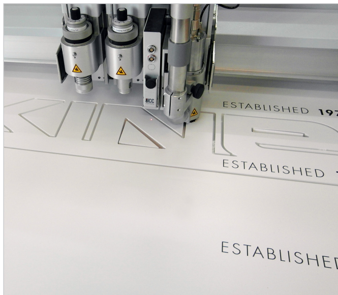
Zünd cutter processing sign foam.